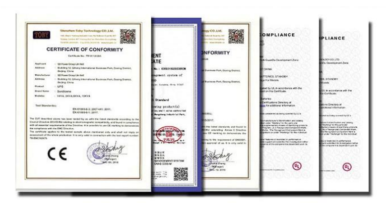
CERTIFICATION:ISO, CE, ROHS, UL, MSDS